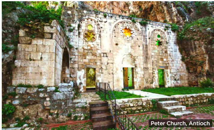
Peter Church, Antioch

You will depart early for Yalvaç, the site of the Roman colony of Pisidian Antioch. Paul visited this city on his three missionary journeys. His first recorded sermon in Acts 13 addressed the congregation of Jews and Godfearers in the synagogue. You will also visit the St. Paul Room in the Yalvaç Museum. Then you will make a scenic drive through the Pisidian lake country before descending through the Taurus Mountains to the plain of Pamphylia. Dinner and overnight in Antalya. (B,D)