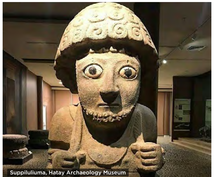
Suppiluliuma, Hatay Archaeology Museum

Early Morning flight to Hatay airport ; we begin with site visits at Tel Tayinat and Tel Atchana; after lunch where you will taste Antakya's famous dessert, künefe, we will visit the hippodrome and temple site with a local archaeologist; finally, we tour the museum and the archaeology hotel in Antakya for dinner and overnight. (D)