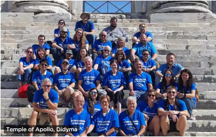
Temple of Apollo, Didyma