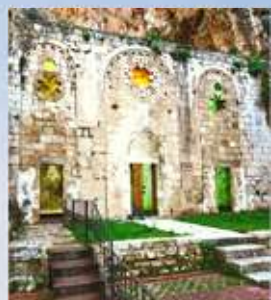
ST. PETER CHURCH